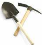
Shovels & Picks