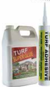
Turf Super Glue (optional)