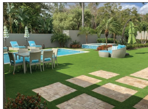
13 | Clean Up