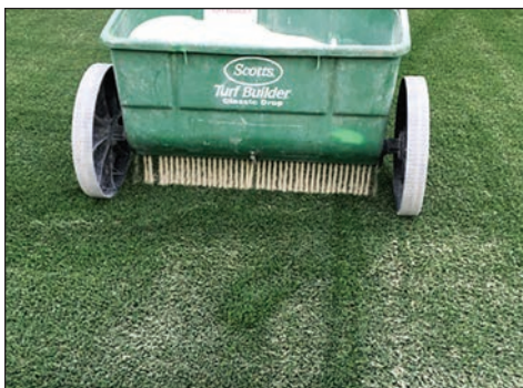
11 | Add Fill