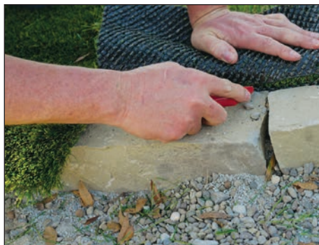
9 | Trim & Cut