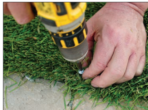
10 | Nail & Fasten