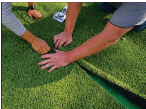
8 | Seam Each Piece of Turf