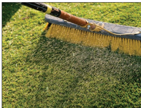
12 | Brush To Lift Blades