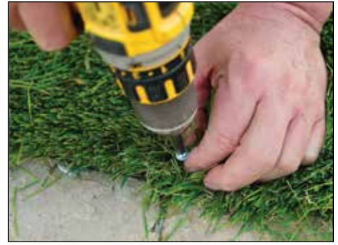
10 | Nail & Fasten