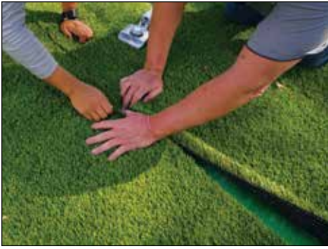
8 | Seam Each Piece of Turf