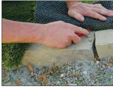
9 | Trim & Cut