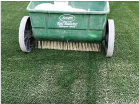
11 | Add Fill