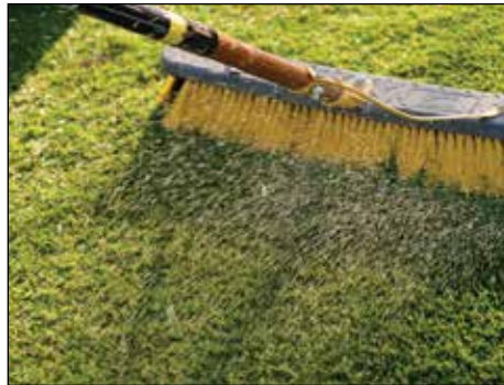
12 | Brush To Lift Blades