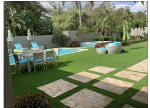
13 | Clean Up